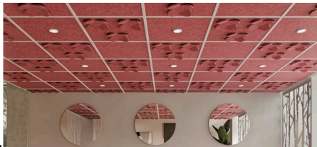
BuzziSpace 10th Floor 10-111