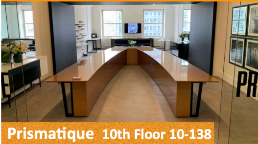
Prismatique 10th Floor 10-138