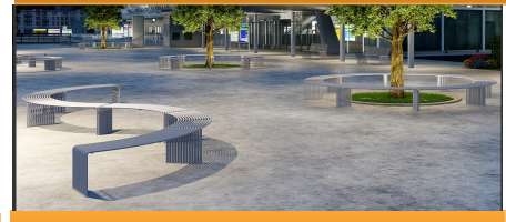
Via Outdoor 10th Floor 10-148