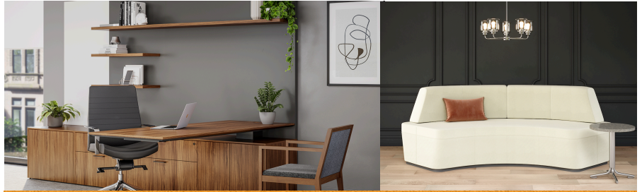
Krug Commercial/Healthcare 3rd Floor - 373