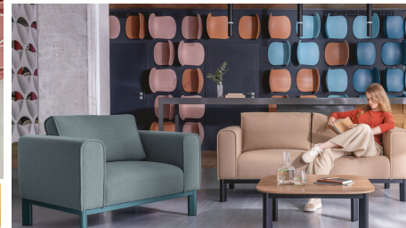
Via Seating 10th Floor 10-148